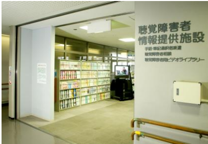
Facility for the Provision of Information for Hearing-Impaired Persons.