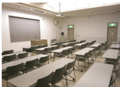
Large & Small Meeting Rooms

⑦ Restaurant: This 60-seat restaurant is attended by a waiting staff. This restaurant also makes food deliveries to the Rapport Box, etc.